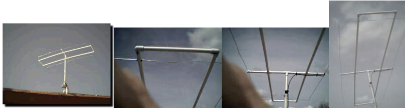
As we can see here, Larry's moxon is set up on a small pvc support and a light duty tv rotor.

6 meters opened up today. I pointed east and worked all up and down the east coast ! It was GREAT ! Its a keeper !!! 5 9 from all stations. 73's Larry WAOWOX"